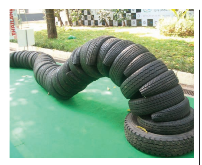
Tyre pyrolysis is a process used to reprocess the abundant tyre waste into useful material

standard technology imported from China, emitted carbon particles and methane gas.