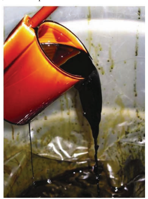
Pyreco reclaims carbon from waste

Pyreco would like to see a world consortium set up by tyre pyrolysis operators who deliver best practices in the industry," he opined.